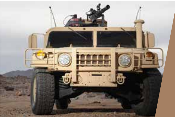
HMMWV w/ MMC & M134D