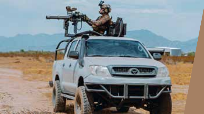
Toyota Hilux w/ MMC & M134D