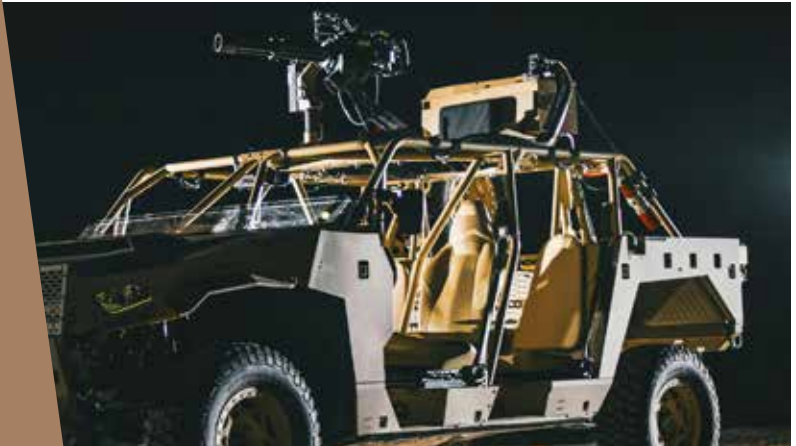
MMC on Polaris Davor w/ M134D

Weapons Compatibility: M134D / M503D / M240 / MK19 / MK48 / PKM / M2 / M3 and more.