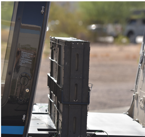
M134D magazine installed in a Bell 407 helicopter

Dillon Aero ammunition magazines are currently in service with the U.S. and foreign militaries, as well as in government service branches.