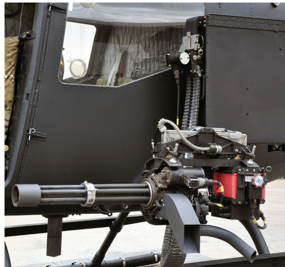
OH-58 Kiowa M134D and magazine