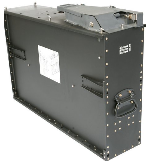
4,000-round magazine equipped with Last Round Switch System