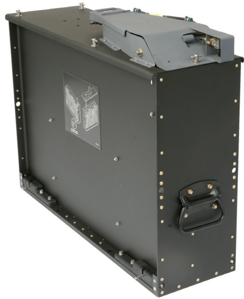
3,000-round M134D magazine equipped with Last Round Switch System