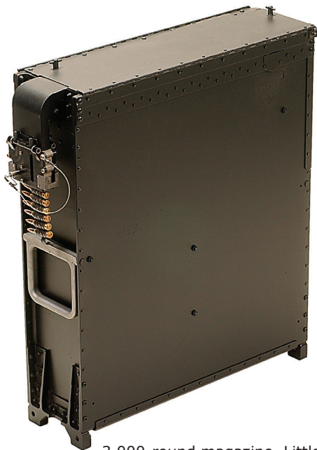
3,000-round magazine, Little Bird