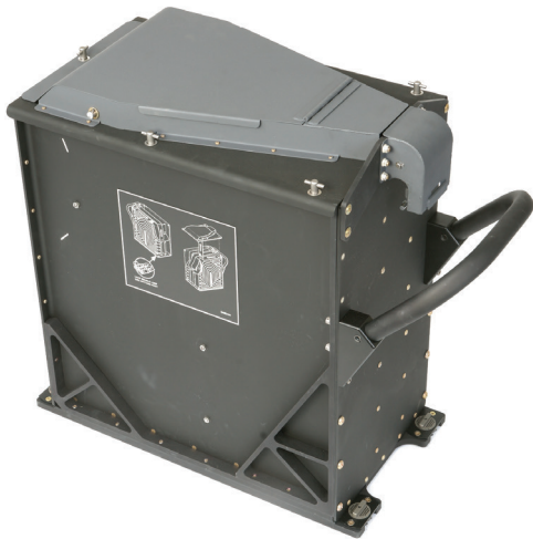
AH407 3,000-round M134D magazine