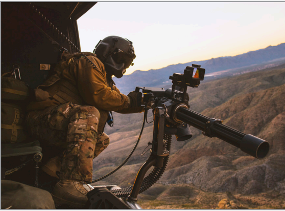
Dillon Aero Huey Mount armed with M134D Minigun

Dillon Aero offers three external beam mounts for the Huey family of utility helicopters. The plug and play design permits a variety of installation options, contingent upon aircraft configuration. Each mount consists of two main support arms, cross beam, and one to three vertical post positions. The mounts attach to factory-installed hard points on the belly of the aircraft. Installation is possible within a few minutes.