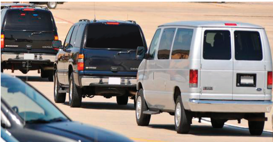
Convoy being protected by a concealed CEV