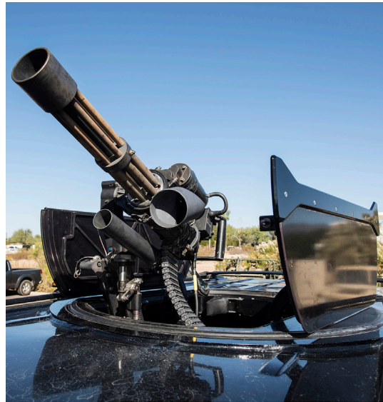
Convoy Escort System