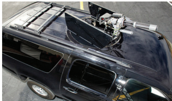
CEV System deployed, hatches open and minigun out