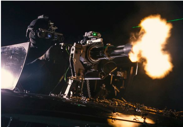
CEV System deployed during night-time operations

The Dillon Aero Convoy Escort Vehicle (CEV) offers exceptional VIP protection with CNC-machined, aerospace-grade components, including a concealed Dillon Aero M134D in the cabin. The incomparable design and exceptional efficiency of the CEV combine for a formidable defensive armament system. While the Minigun is undetectable, the system may be fully deployed in under three seconds at the first sign of danger, and fully concealed in less than eight seconds. Just as the M134D is hidden, the vehicle itself is visually indistinguishable from other commercial automobiles in normal mode. However, a variety of modification options ensures that this vehicle is anything other than typical. Indeed, the Dillon Aero Convoy Escort Vehicle delivers unparalleled covert threat mitigation.