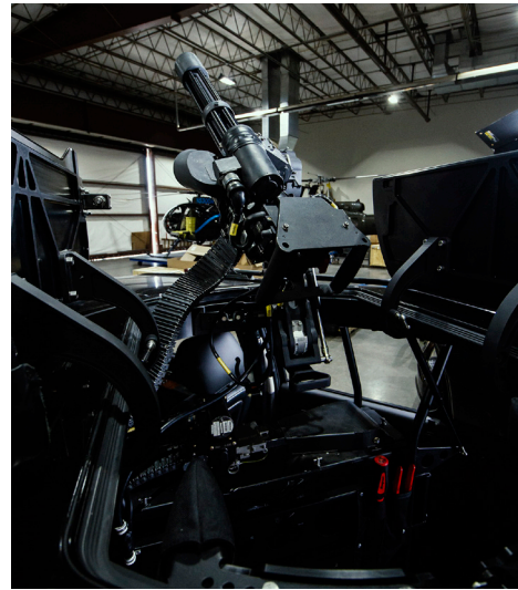
M134D deploying on a CEV System