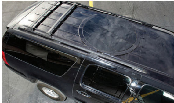
CEV System stowed to maintain low profile

CONVOY ESCORT VEHICLE PART NUMBER: DGMT7002 NSN: PENDING