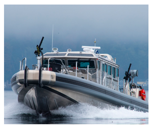
Dillon M134D-M Marinized system for Naval operations