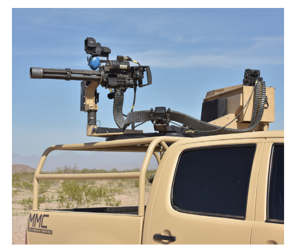
Dillon Aero MMC Vehicle System with a 3,000-round magazine for ground applications

Dillon Aero ammunition magazines are currently in service with the U.S. and foreign militaries, as well as in government service branches.