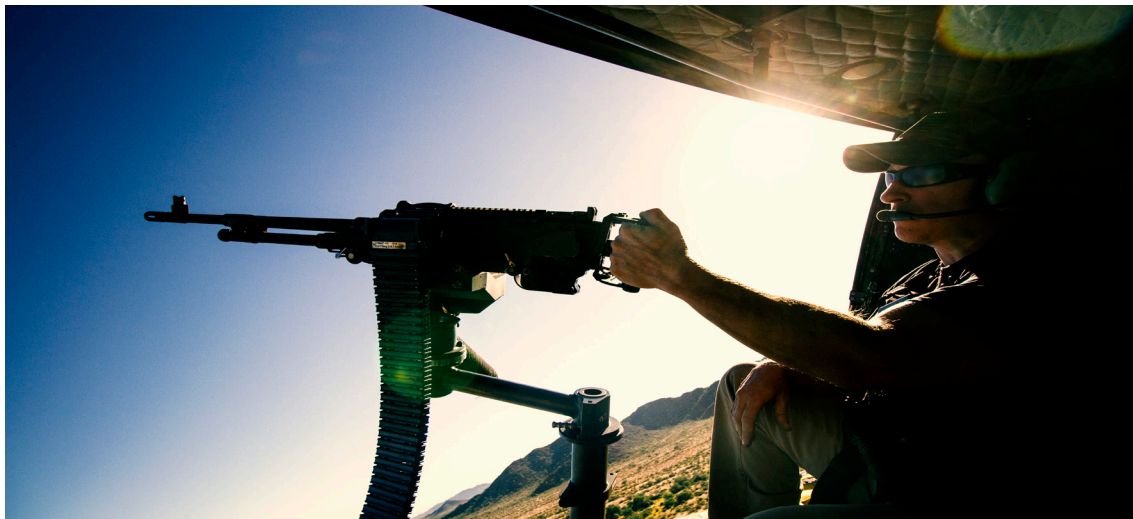
M240/MAG58 Mount in-flight on a UH-1 helicopter

The Dillon Aero line of gun mounts extends beyond the M134D. A lightweight universal gun mount option is also available for the M240/MAG58. Its design ensures compatibility with the M134D Vertical Arm. As such, any platform equipped with an M134D system is interchangeable with the M240/MAG58 in a matter of seconds.