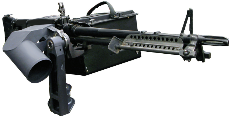
Dillon Aero M60 mount