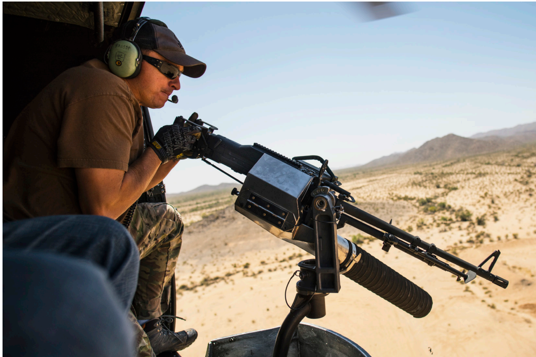
M60 Mount in-flight on a UH-1 helicopter