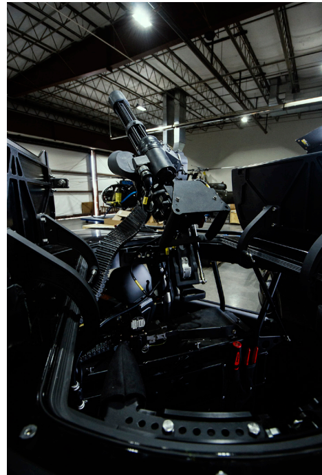
M134D deploying on a CEV System