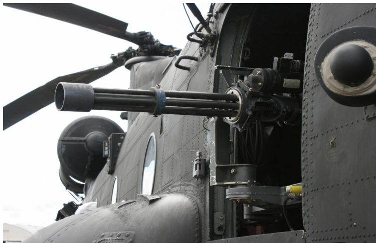
Chinook helicopter affixed with the Chinook Mount and M134D Minigun

Dillon Aero is the sole provider of the Chinook mount to the U.S. Army Special Operations. It is also in service with numerous foreign militaries.