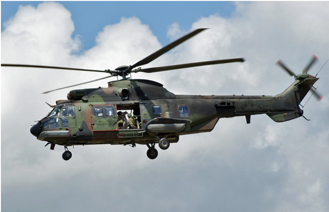
AS532 with M134D