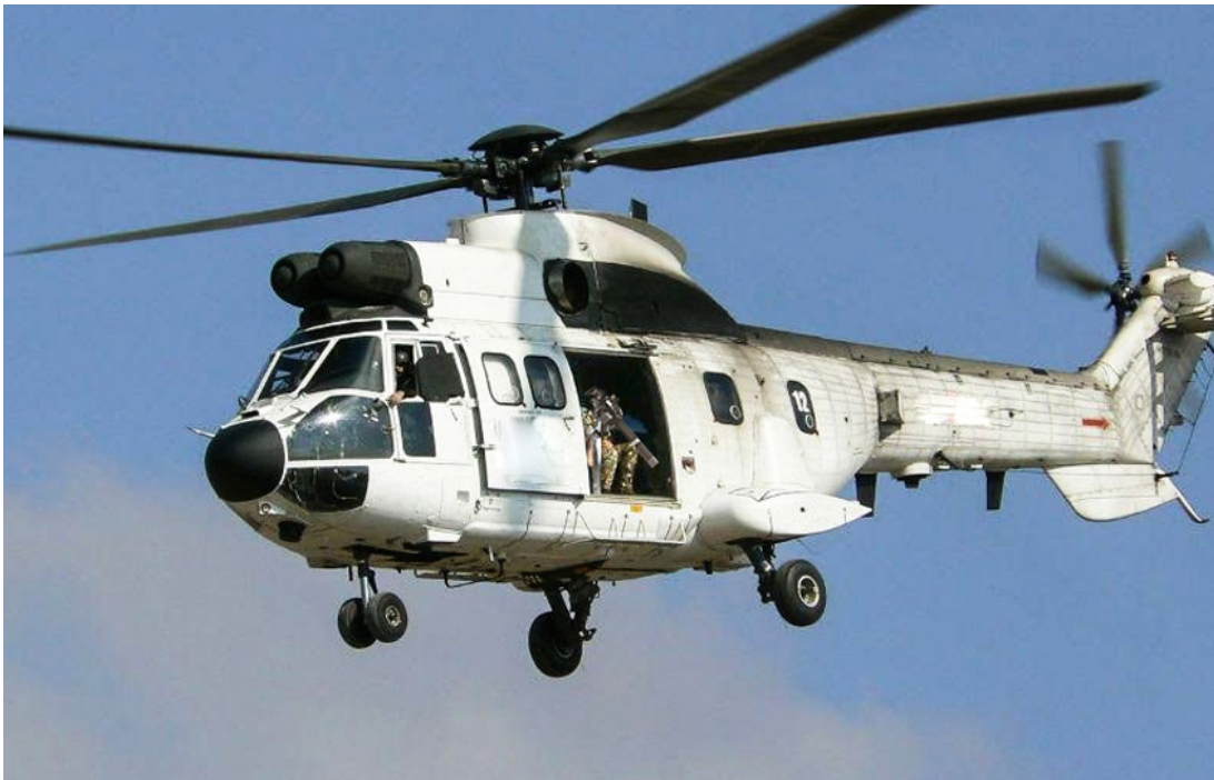
AS332 with M134D