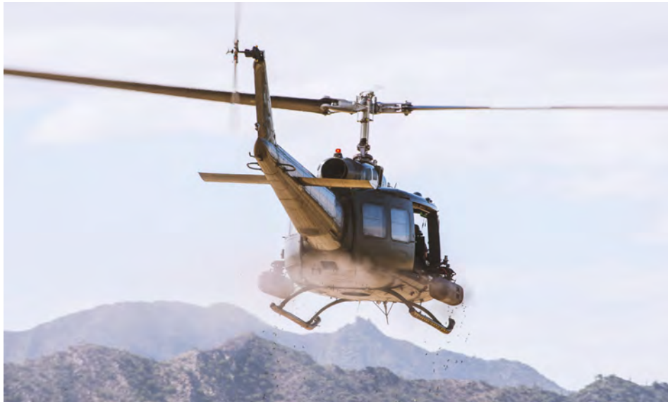
UH-1 equipped w/ DAP-6 Gun Pods