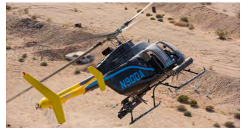
407equipped w/ DAP-6