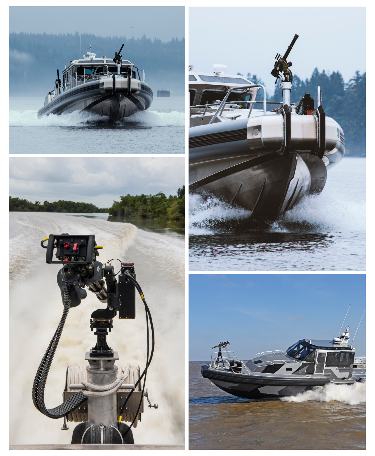
Dillon M134D-M Marinized system for Naval operations