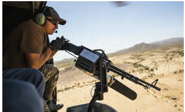
M60 Mount in-flight on a UH-1 helicopter