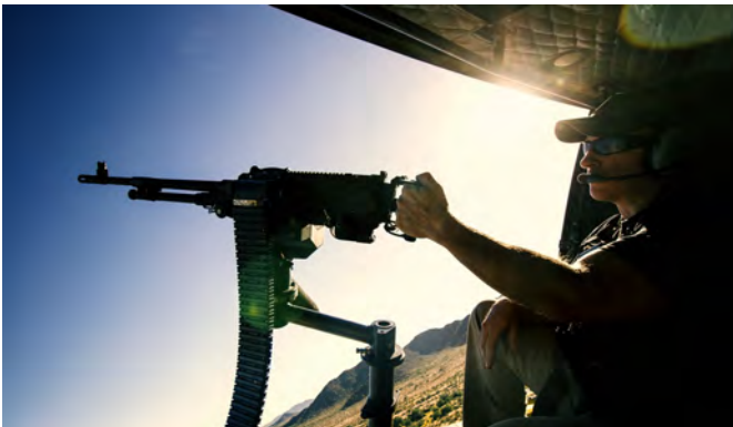
M240/MAG58 Mount in-flight on a UH-1 helicopter