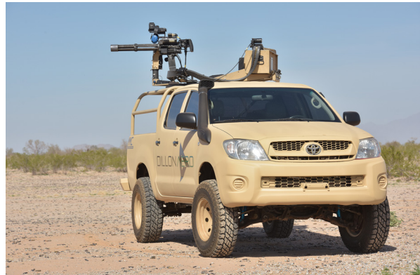
MMC system installed on a Hilux