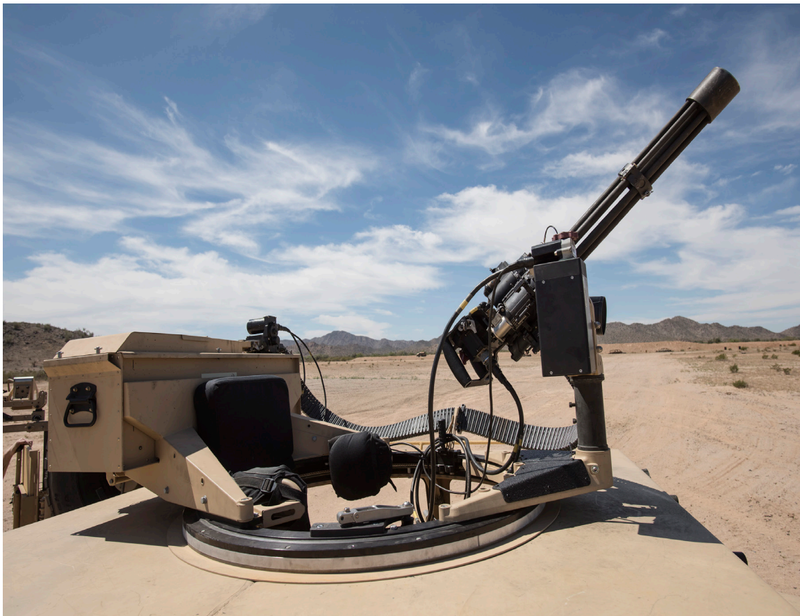
MMC system mounted with M134D