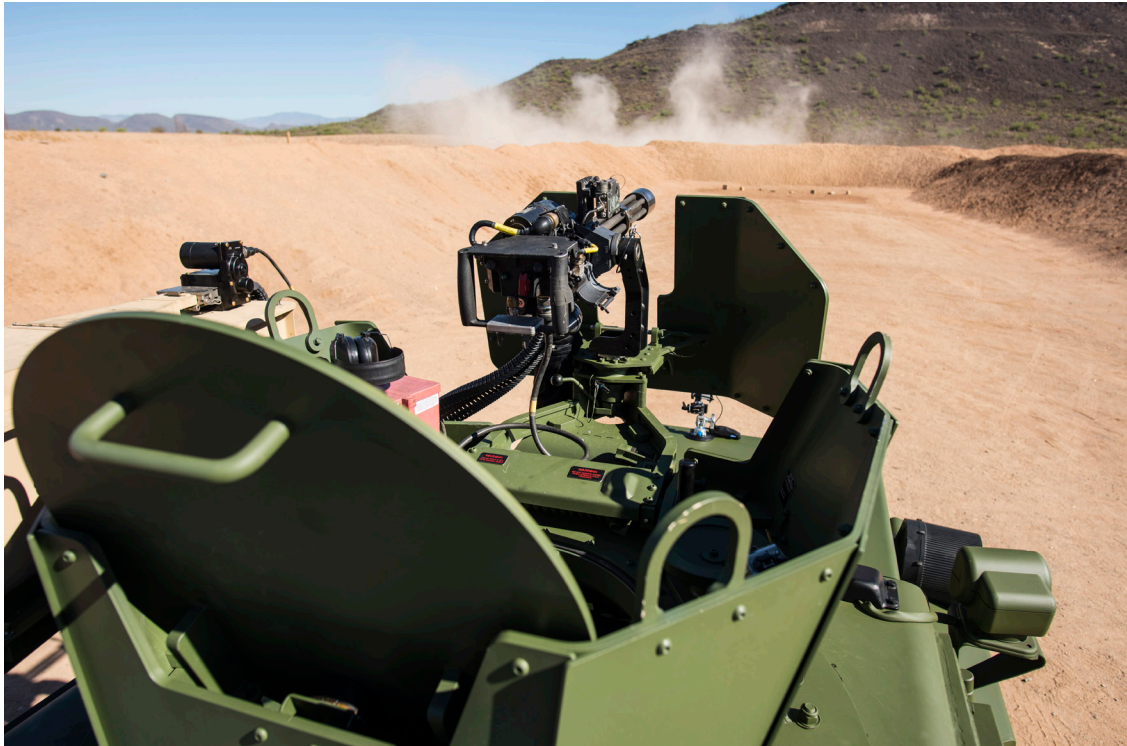
MR550 with M134D on RG-32M