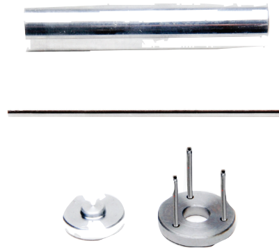
Gearhead service kit