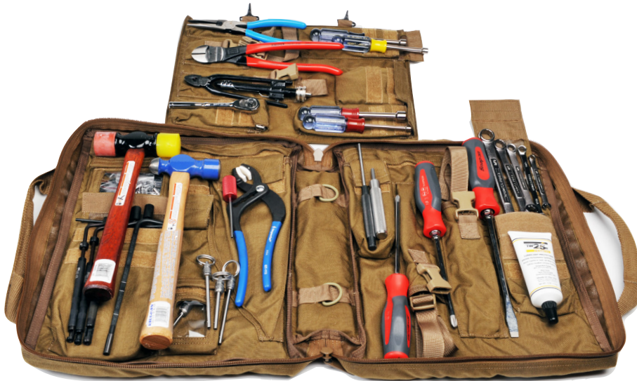
Armorer's tool Kit

The Dillon Aero Armorer's Tool Kit contains the tools and spare items required for maintenance of the M134D system at the armorer level. The kit is stored in a sturdy lightweight carrying case. The rugged material and fold-out design ensures protection of the equipment. Dillon Aero maintains an inclusive, itemized list of all equipment within the Toolkit. For more information, please contact Dillon Aero.