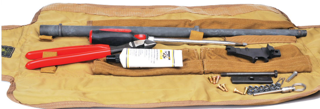
Gunner's Spares/Tool Bag

GUNNER'S SPARES/TOOL BAG PART NUMBER: DMG5050 NSN: 1005-01-579-6924