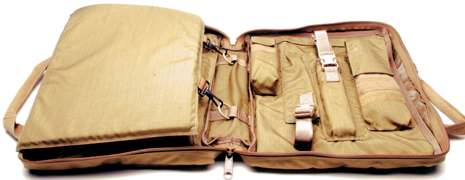
Tool kit carrying case

ARMORER'S TOOL KIT PART NUMBER: DATK1050 NSN: 5180-01-573-9682