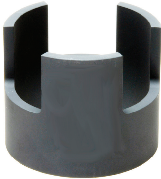
Rotor disassembly tool

The Dillon Aero M134D Assembly/Disassembly Fixture Kit contains specialized fixtures and tools necessary for the complete disassembly and reassembly of the M134D. This kit contains a rotor disassembly tool, gearhead service kit, delinker assembly fixture, and bolt assembly fixture.