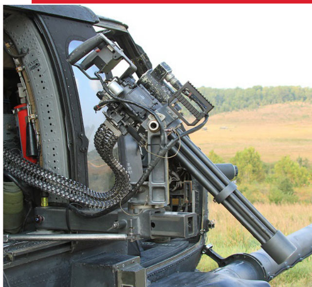
Crew served M134D Minigun on an MH-60, system is compatible with UH-60 A, L, M, S-70i Models