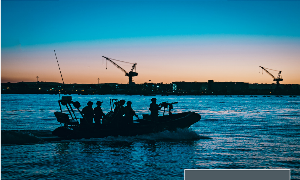
On patrol with the M134D