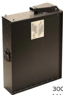
3000 round M134 magazine

Dillon Aero Magazines are designed to ensure flawless ammunition feeding for all weapons to include the high rate of fire M134D Minigun.