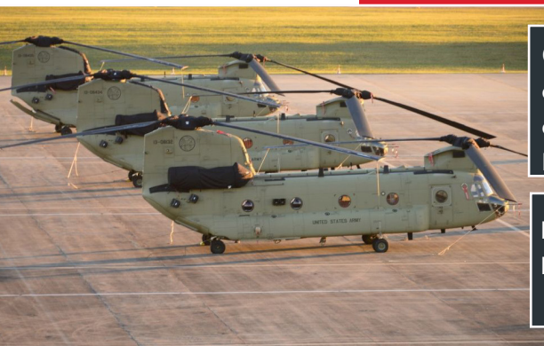
Crew Served M134D Minigun on a CH-47, system is compatible with CH-47 D, F G Models