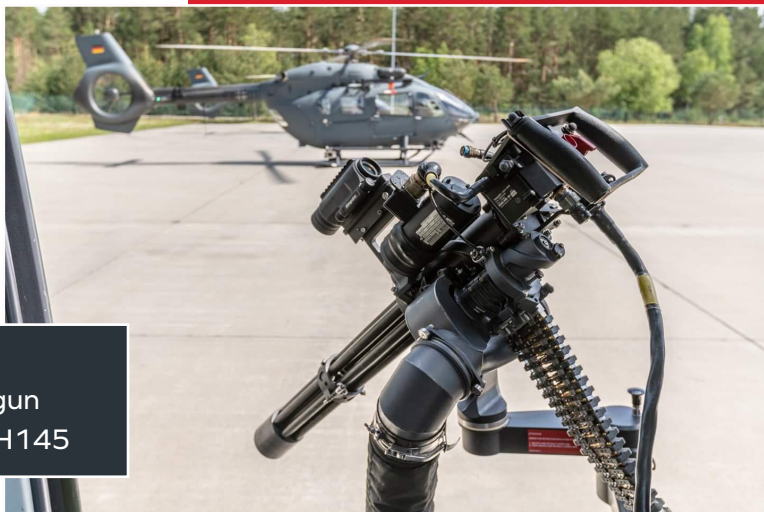
Crew served M134D Minigun on an Airbus H145