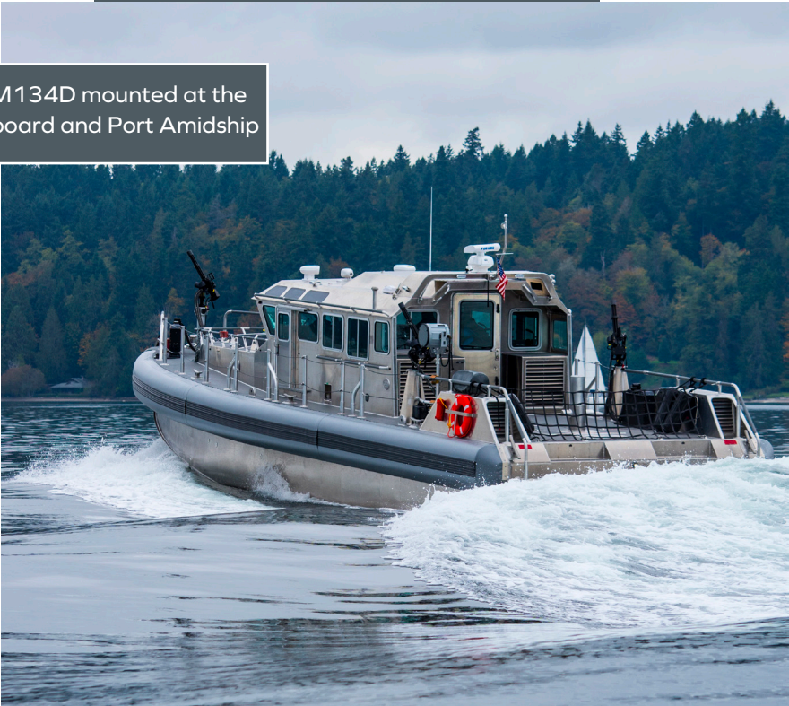
The M134D mounted at the Starboard and Port Amidship