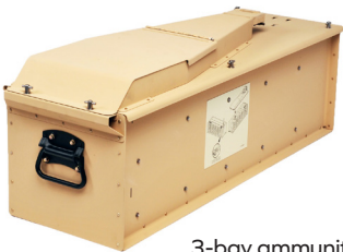
3-bay ammunition can with rollers